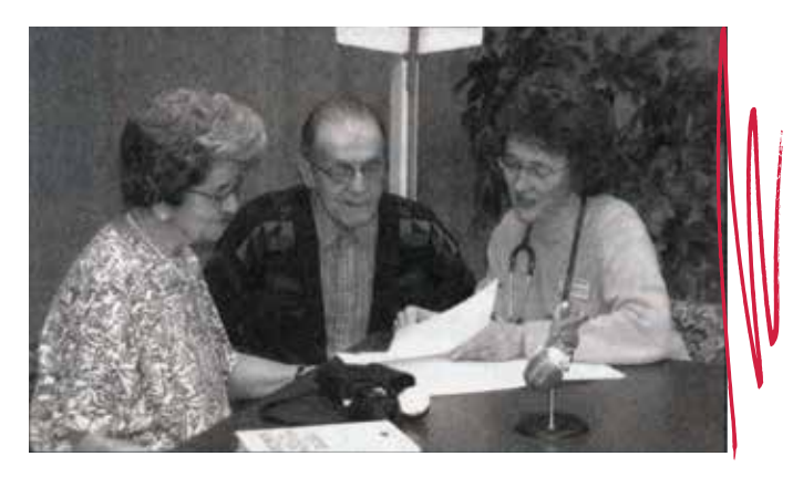
Wellness nurse answering a couple's questions (2003).

Historical documents indicate staff approached the Lyngblomsten Board of Directors in 1978 with proposals to establish a community center and develop a program of health maintenance activities.