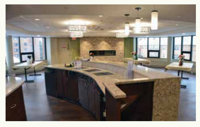
▲ Renovated care center kitchens and dining rooms feature new flooring, cabinetry, flooring, and cozy fireplaces.

In addition to kitchen and dining areas, nine resident rooms so far have been remodeled to appear more welcoming and comfortable, shifting away from a once clinical appearance.